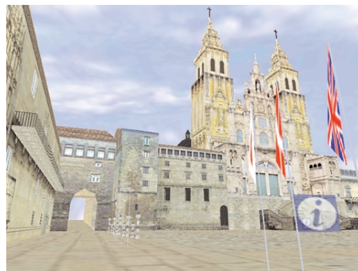
Screenshot of the Santiago 2000 virtual city, the first NAVE application.