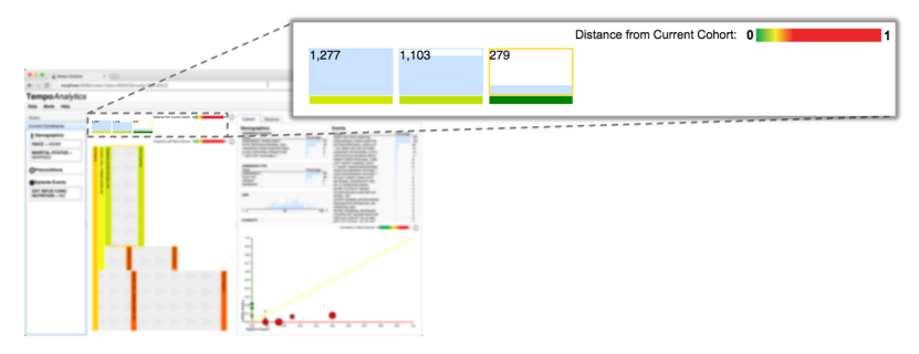
Figure 3: A visual analytics system instrumented to detect selection bias during exploratory data selection. The bread-crumb view in the callout shows increasing drift (lighter green bars) moving back from the current analytical focus (right) to the original cohort (left).

Most critically, omitting dimensions from a visualization can hide issues such as selection bias introduced during filtering and zooming. Recent research has shown that the effects of selection bias in high dimensional visualization can be communicated to users by capturing a user's exploration history and visualizing differences in variable distributions across that history (Figure 3).<sup>12</sup>. Future innovation in this area, including capturing more complex analyses and integrating methods to correct for bias (e.g. post-stratification<sup>13</sup>) is necessary to make ad hoc exploratory visual analysis more robust